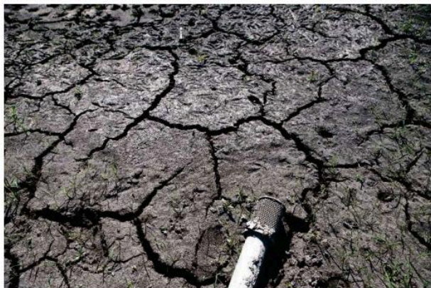
Cracked earth surrounded a hose in a dried pond usually used to irrigate crops at Siena Farms in Sudbury.