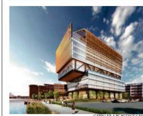
NEW HOME FOR GENERAL ELECTRIC — The Fort Point Channel headquarters will feature a 12-story glass building topped by a solar veil, linked to two renovated brick warehouses. C1.

Police raided both of their homes early Monday, arrest-